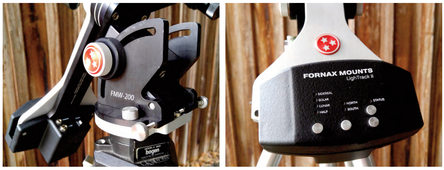
Image 5 - The FMW-200 wedge is accurate and easy to use. Fit and finish are top-notch, complimenting the jewel-like mount perfectly.