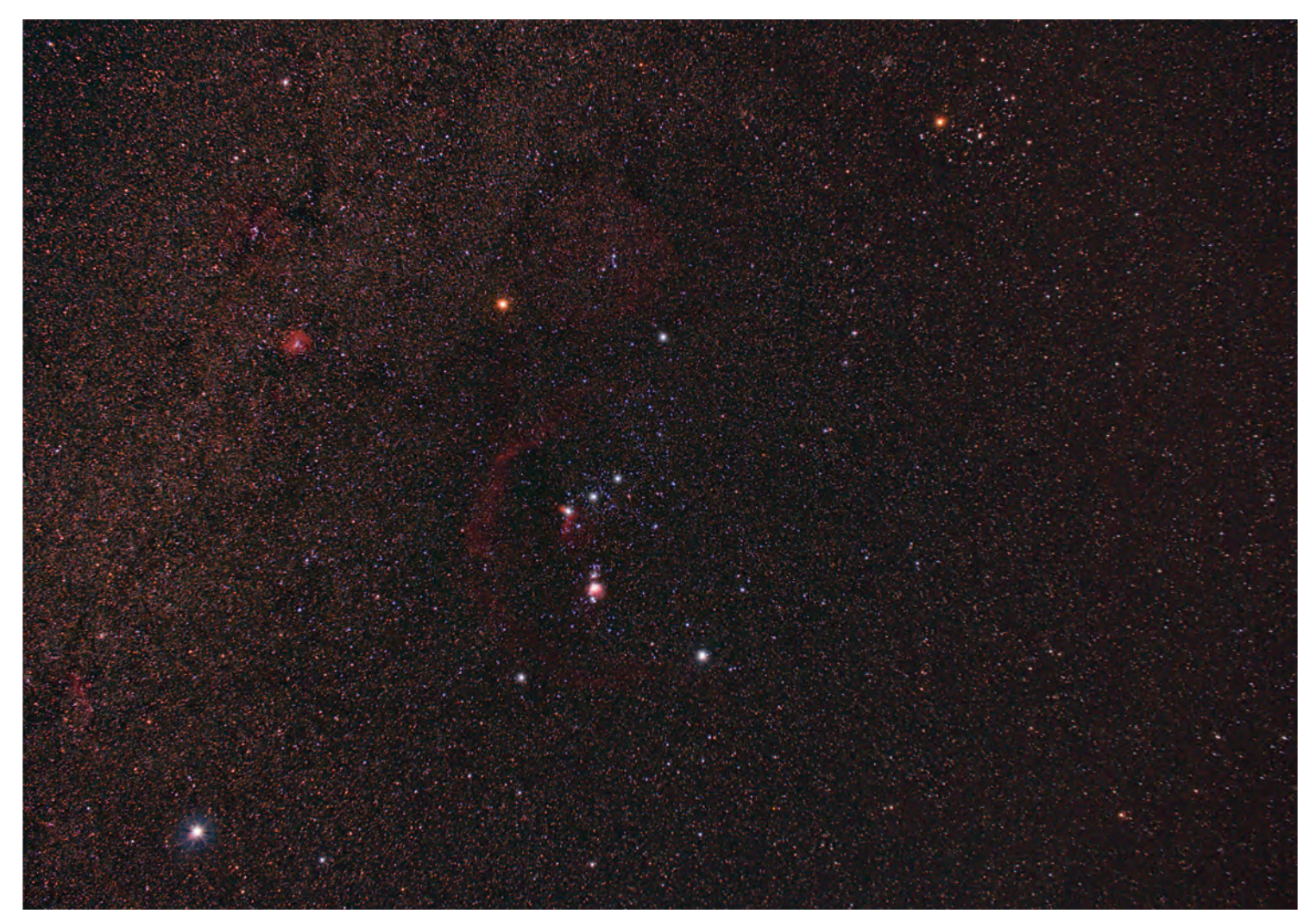
Image 10 - Ultra-wide field of the Constellation Orion region, also captured using the Canon 60Da and the kit lens, this time at its extreme 18-mm short end. It too is a stack of ten 3.0-minute images (ISO 800).