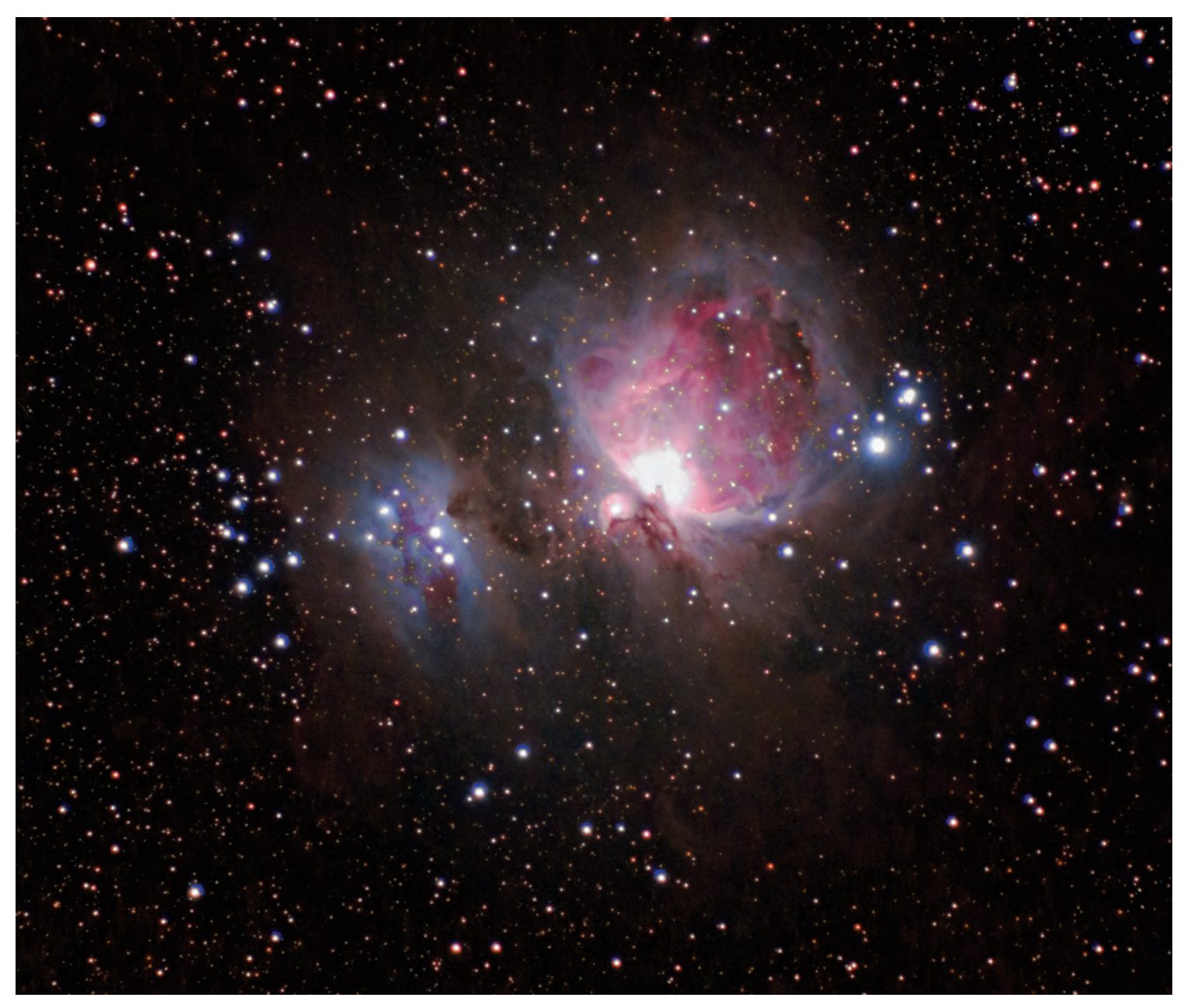
Image 9 - M42 imaged as a stack of ten 3.0-minute images captured with a Canon 60Da fitted with a Canon 18- to 300-mm kit zoom lens set to its long end, 300-mm (ISO 800).

as weighing 1.3 kilograms (2.86 pounds), and although I had nothing on hand to confirm that claim, that felt about right, which is to say, the mount is remarkably lightweight. Fornax also claims the mount is rated for a maximum payload of 6 kilograms (13.2 pounds), and although we never loaded it to near that capacity, I'm satisfied that is well within its capability.