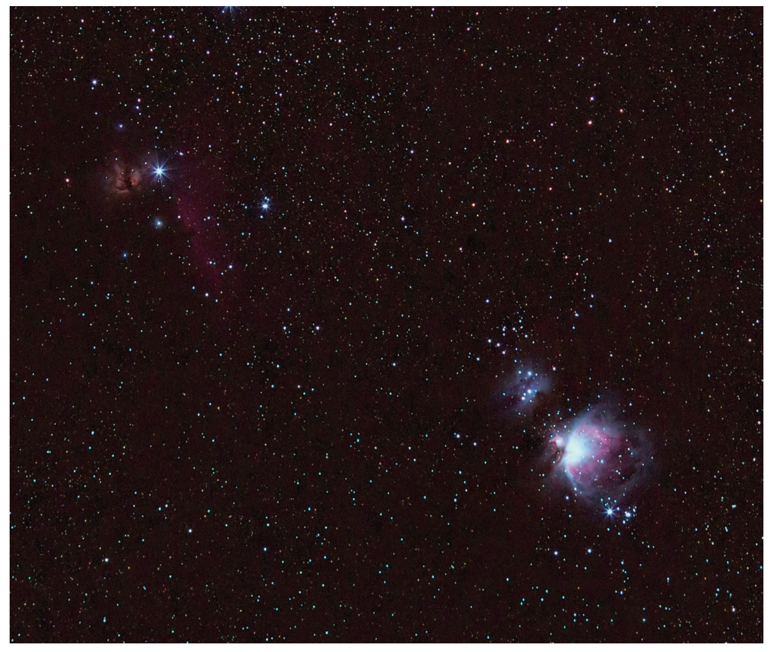
Image 8 - A single 5.0-minute exposure of the Orion-Horsehead region cropped for the center of the frame. It was captured with a Canon 6D through a 135-mm lens, both supported by the Lightrack II.