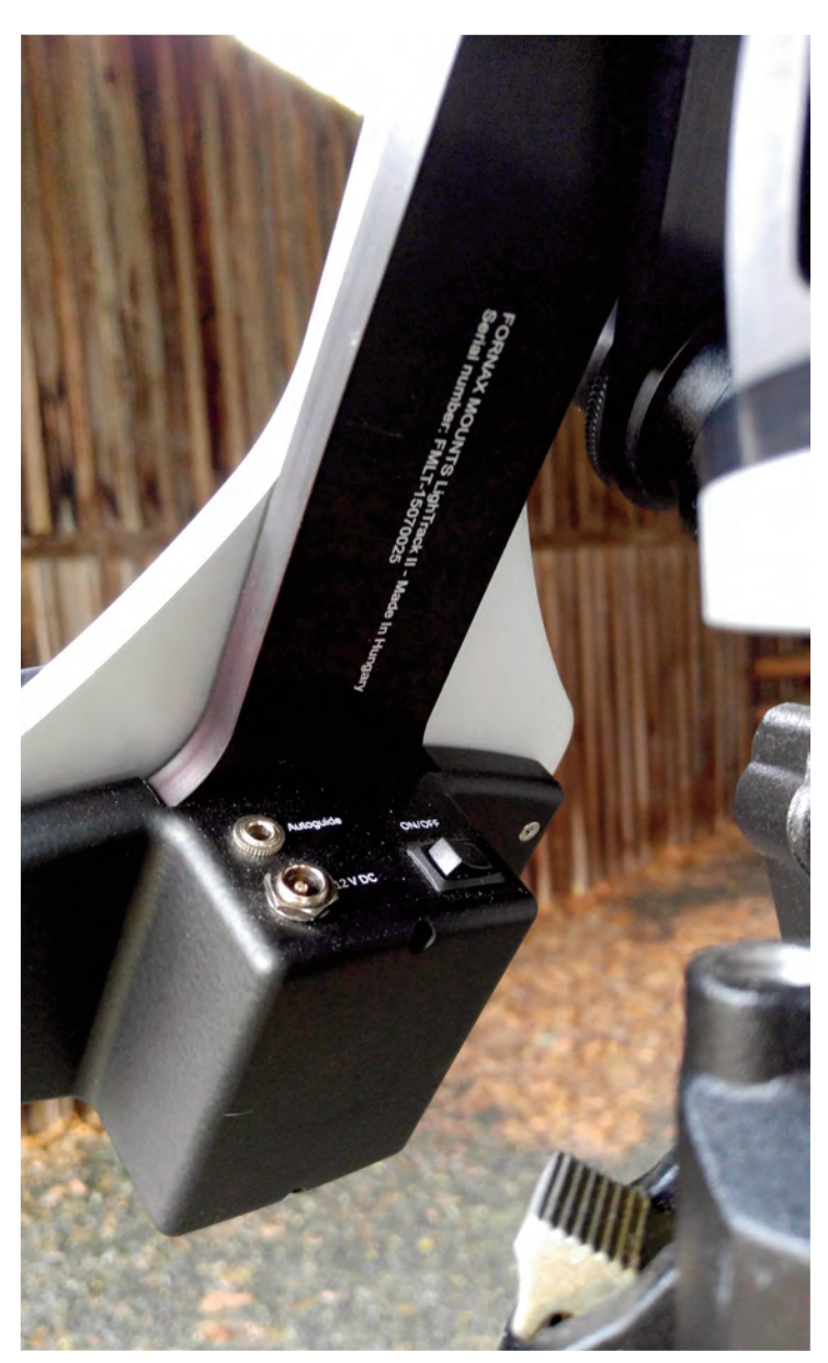
Image 7 - The mount's on/off button, 12-volt DC power port and custom autoguider port are located within easy reach on its underside.

The package we tested was Fornax's full-set option, in-