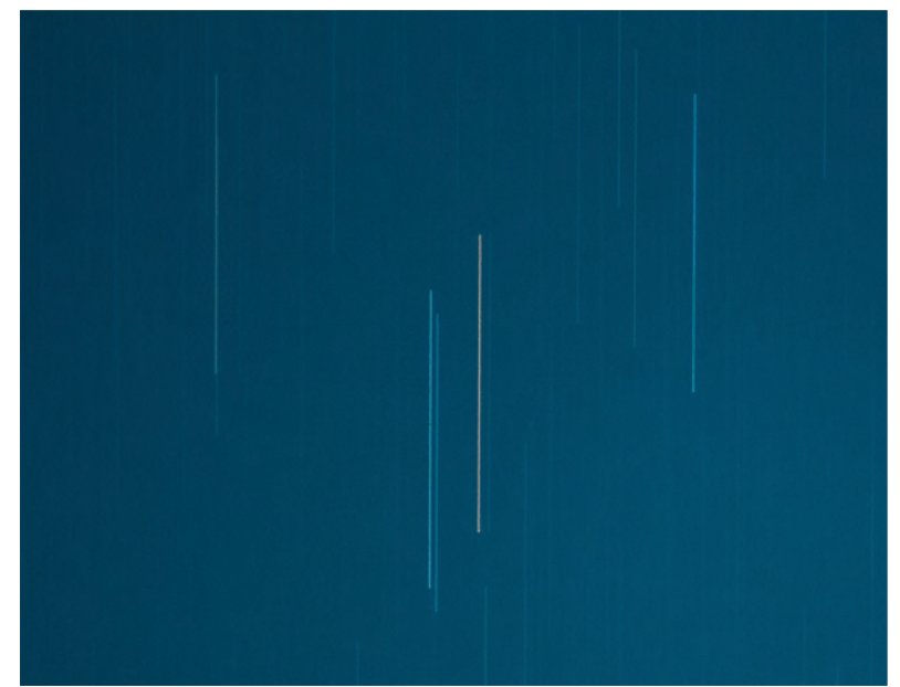
Image 11 - TA single 3.5-minute exposure at 300-mm, cropped to show detail, captured with the Lightrack II purposely misaligned by 60 degrees to show tracking error. Resolution of the imaging system was 2.95 arc seconds per pixel, so the images demonstrate absolutely minimal error.