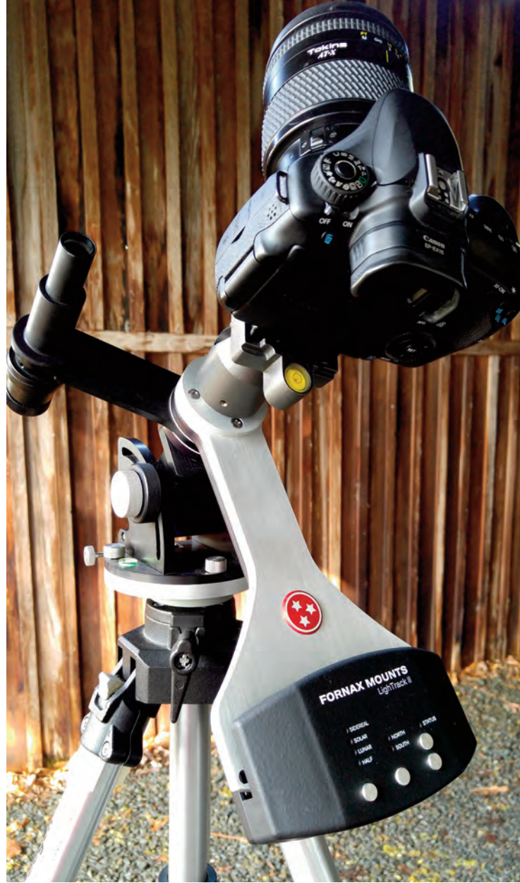
Image 3 - The drive-disc bearing surface of the Lightrack II's virtual disc section is actually the inner surface of the slot formed along the outer (bottom) edge, which position serves to protect the critical drive-bearing surface. The drive roller is positioned inside of the black motor housing.