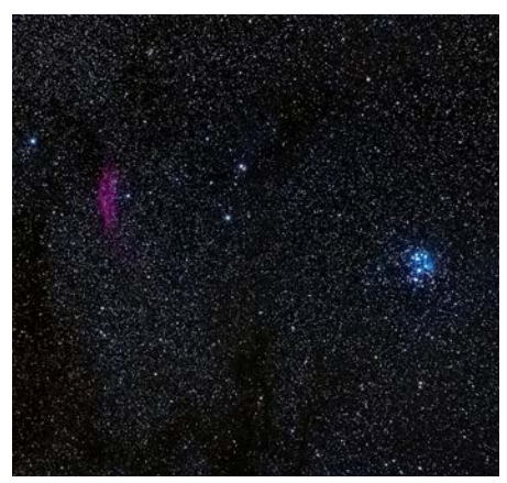
This wide field shows the Pleiades (M45, right) and the California Nebula (NGC 1499). He used his Canon 60Da DSLR with a Rokinon 35mm f/1.4 lens on the LighTrack II. This image combines 15 three-minute exposures at ISO 1600.

My results indicate that when you use a heavy camera/lens combination, it's important to use some sort of balancing